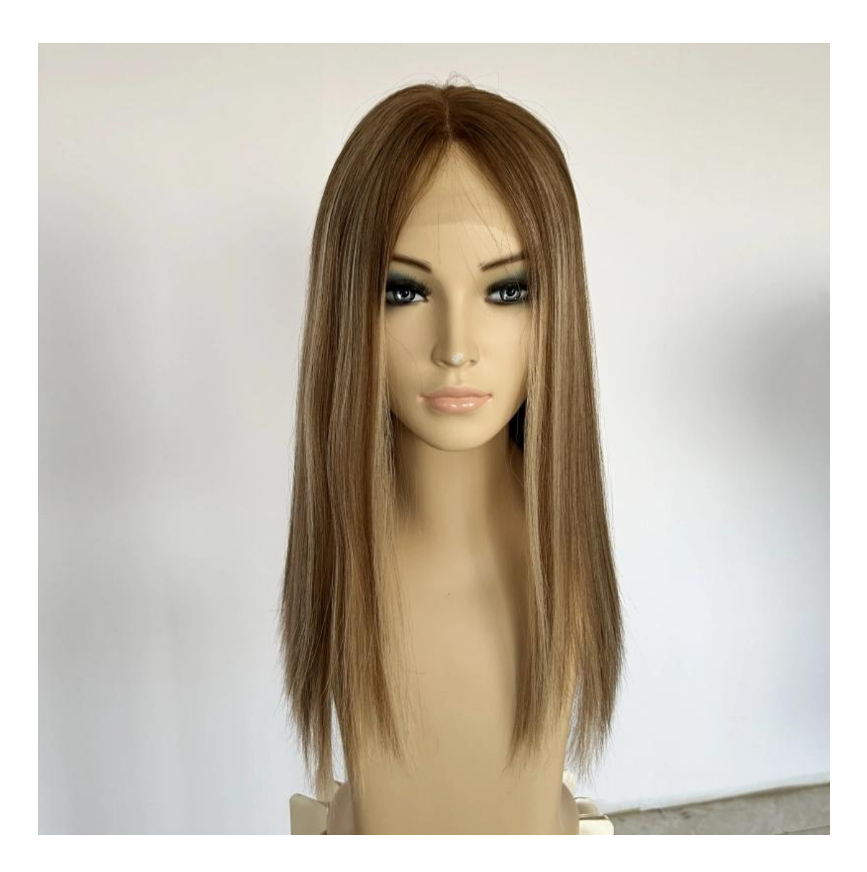
The 14-24 inch length of the hair provides ample styling options. Whether you prefer to wear your hair straight, curled, or in an updo, this wig can accommodate a variety of styles. The high-quality European hair can be styled with heat tools, just like your natural hair, giving you the freedom to change your look as often as you like.