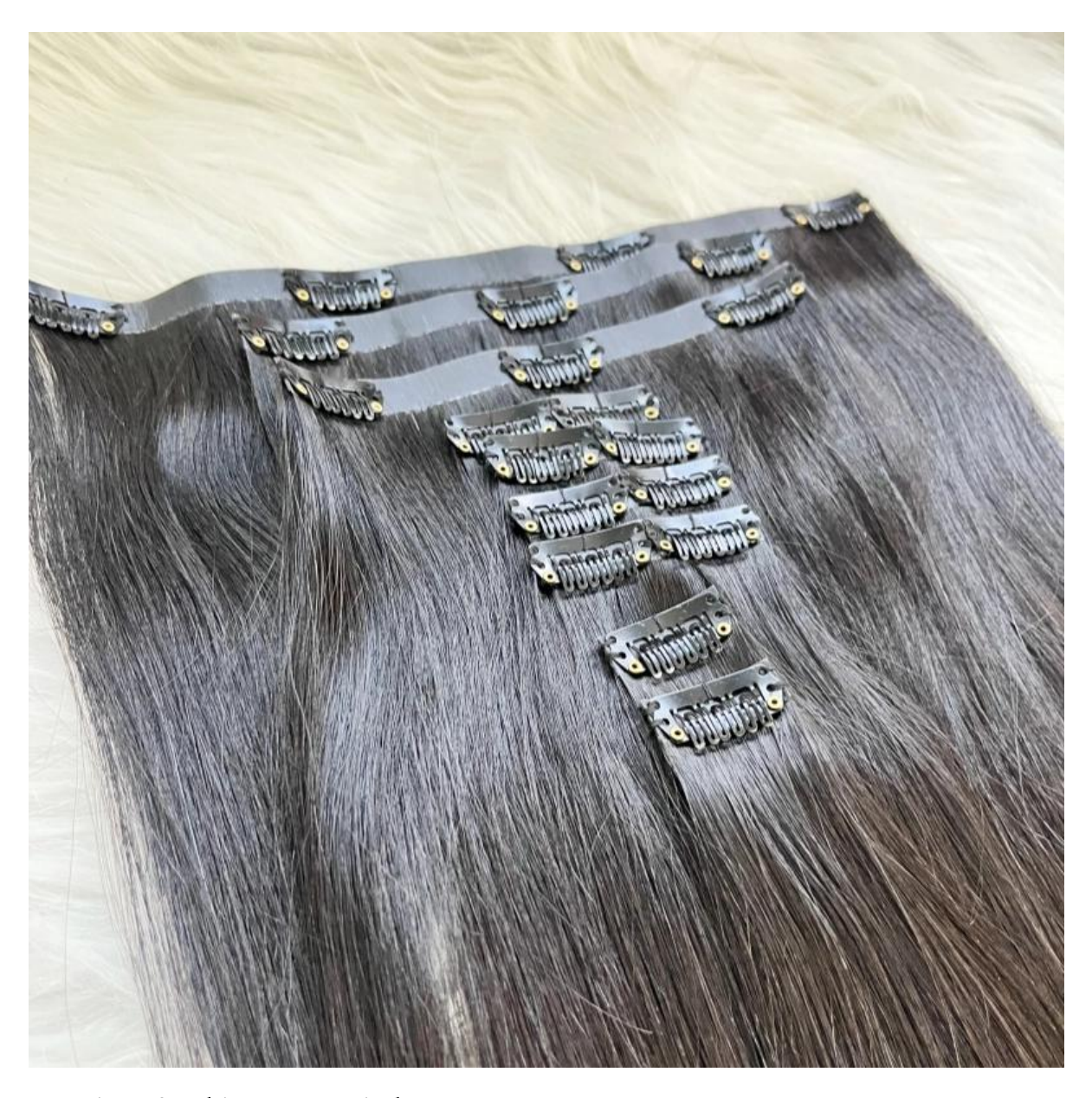
Premium Quality Materials

Introducing the ultimate solution for instant length and volume—Emeda Hair <u>Clip-In Extensions</u> for Black Hair. Whether you're looking to add fullness to your natural hair, experiment with a new style, or prepare for a special occasion, our clip-in extensions offer unparalleled quality, versatility, and convenience. Let's delve into the unique features and benefits that make our product stand out in the competitive world of hair extensions.