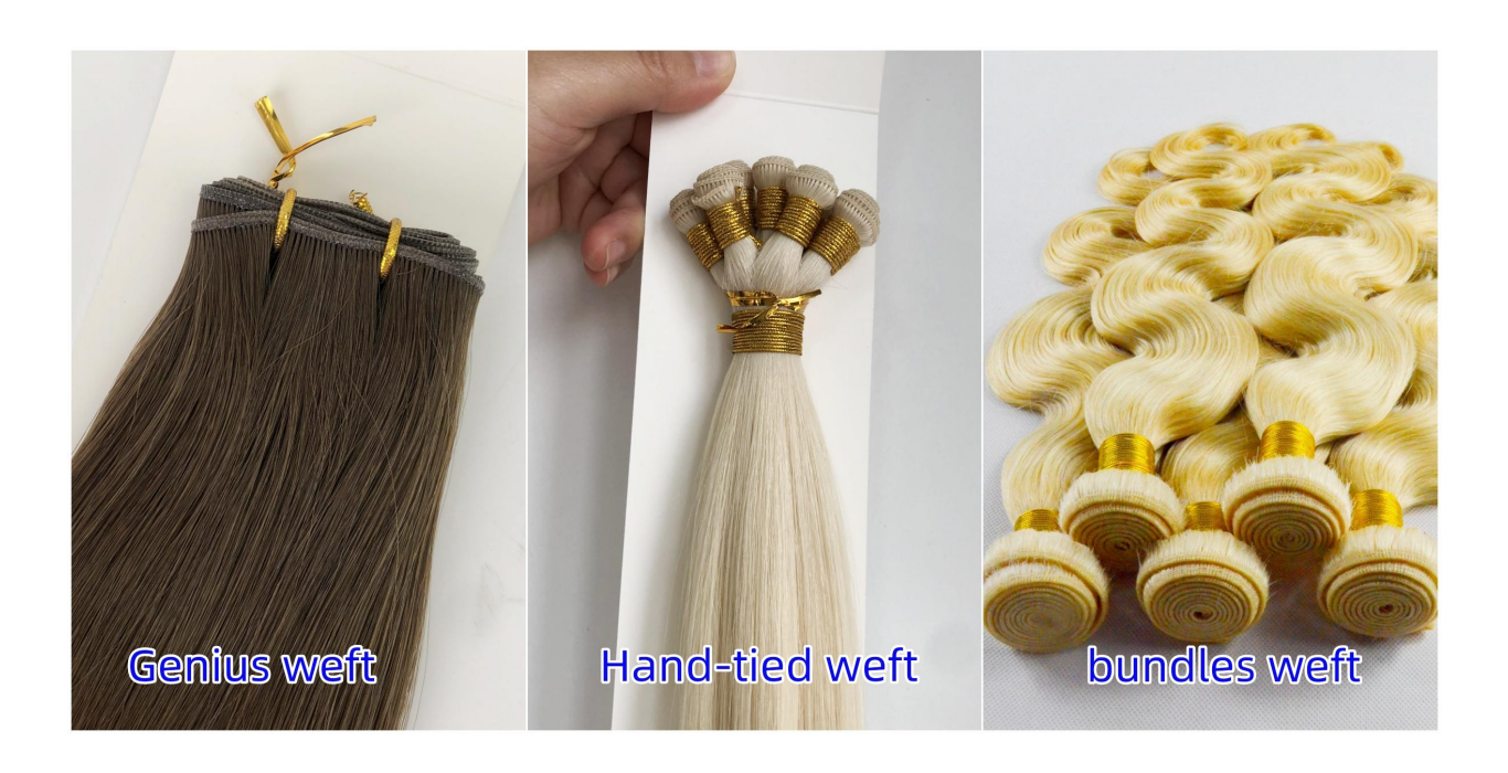
Genius Weft Hair Extensions