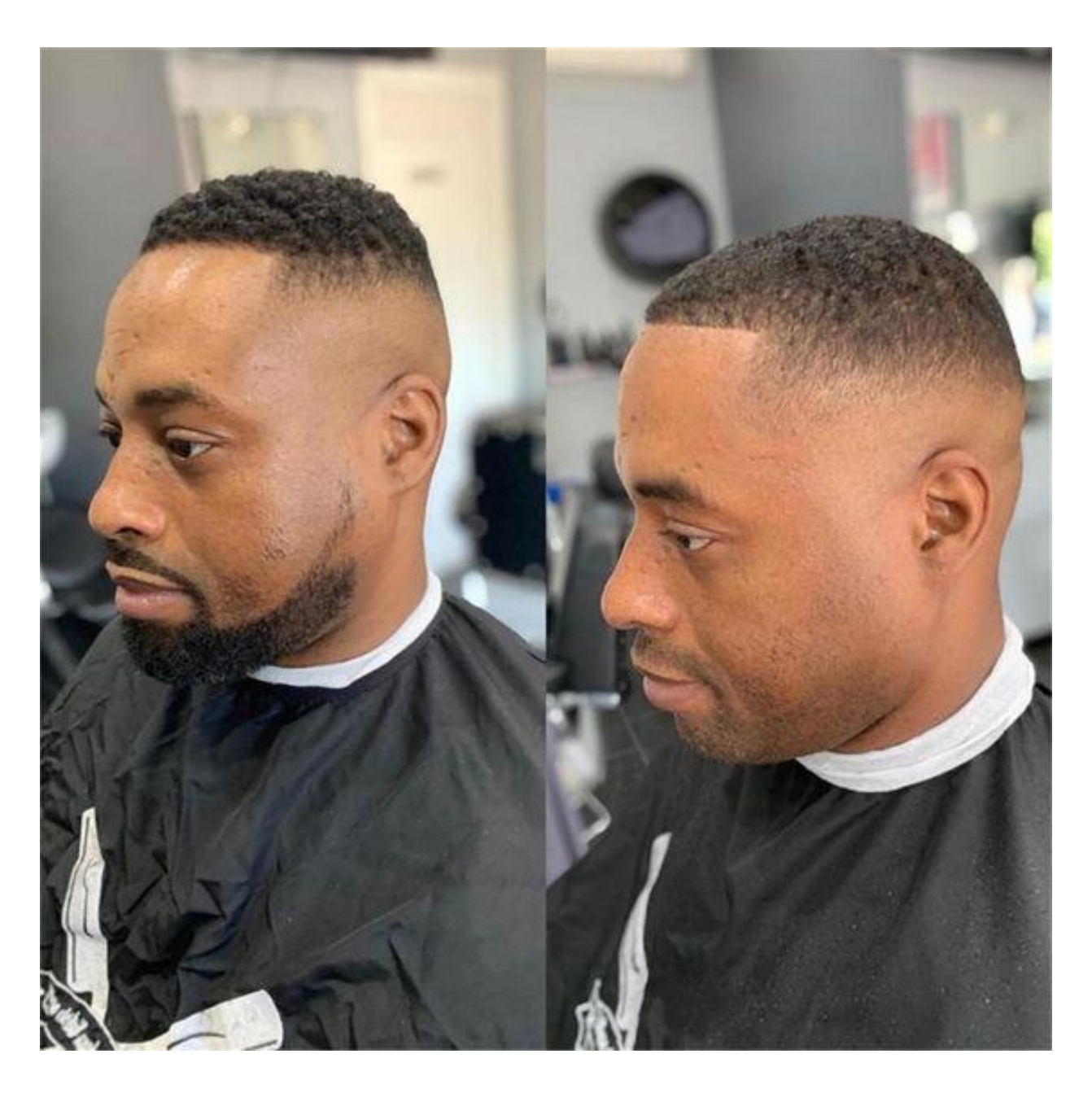
The Emeda #1b Men Beards are versatile and suitable for various applications, including: