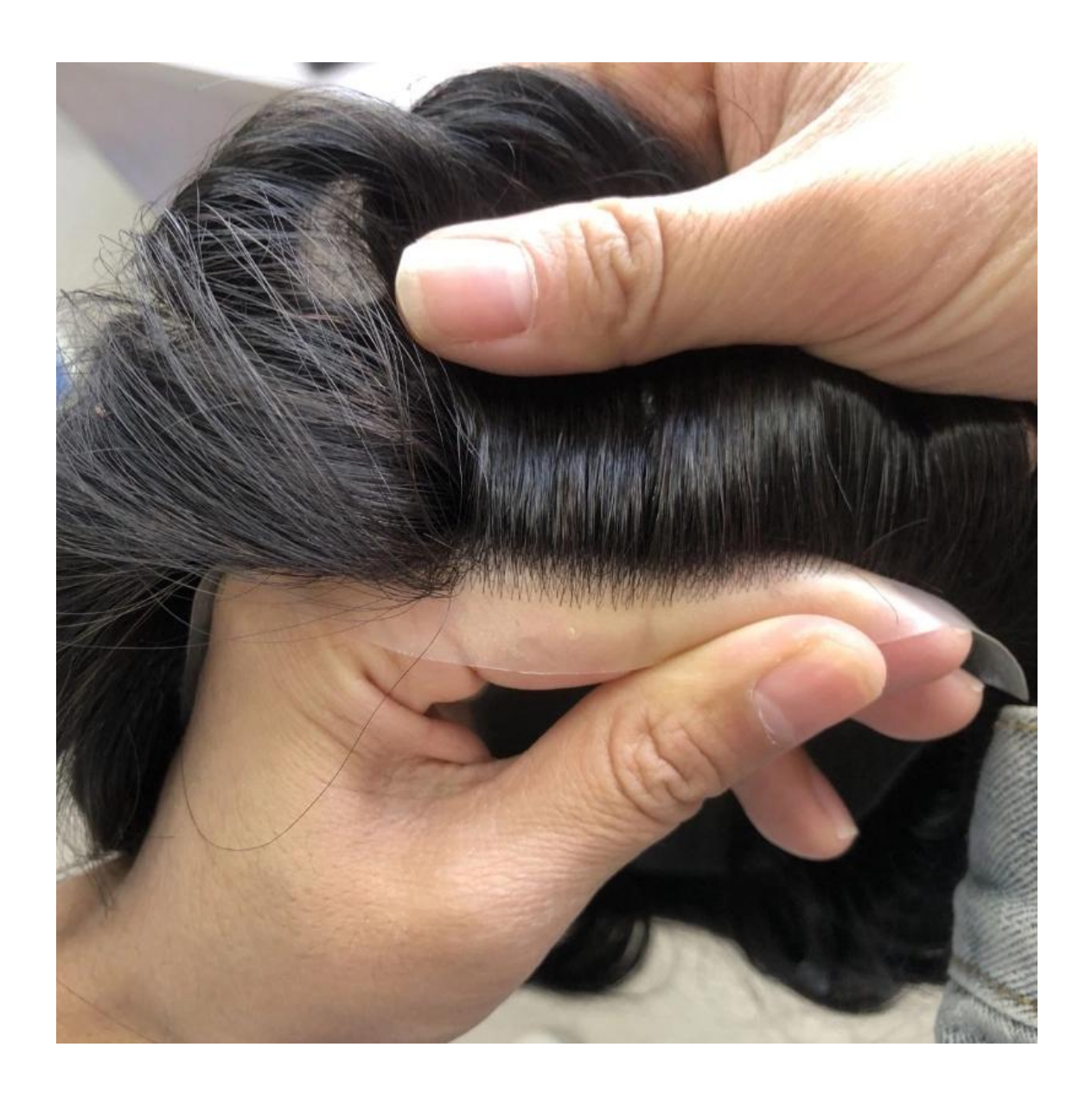
Detailed Pros and Cons of Mono Base with PU Around Apollo Toupee